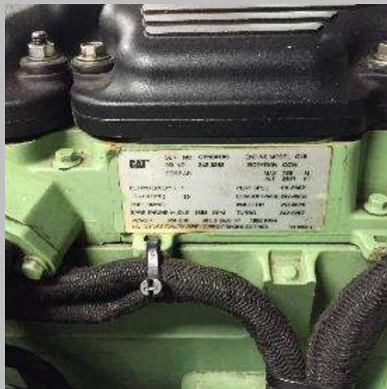
The test is performed on a Catapillar, Type C18 und 624 PS.