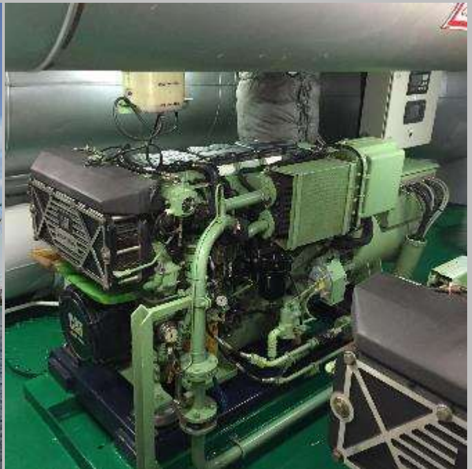
Test Engine Catapillar, Type C18